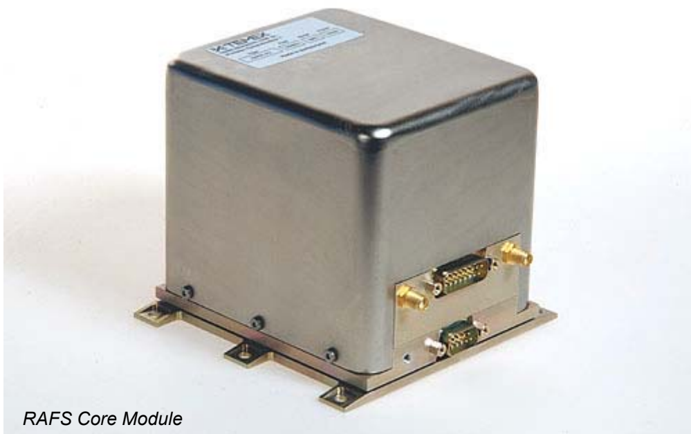
RAFS Core Module